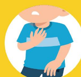
Heart beating very fast